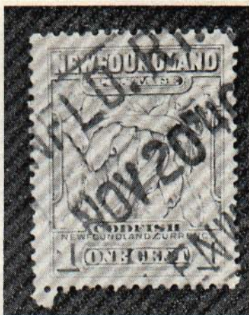
Fig. 7—N-55A GLENWOOD property Bob Soper