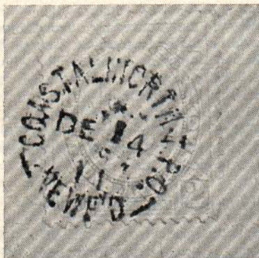
—Error N-18 for N-16, Palmer Moffat