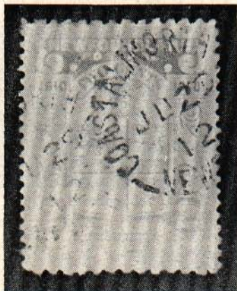
Fig. 2—Error N-18 for N-16, Joe Purcell

having been delisted, we have established this error as a major listing, N-18, with the earliest date of December 14, 1911 and the latest date of June 29, 1912. Since N-16 is not at all so uncommon, we wonder if there are other N-18s out there waiting to be found.