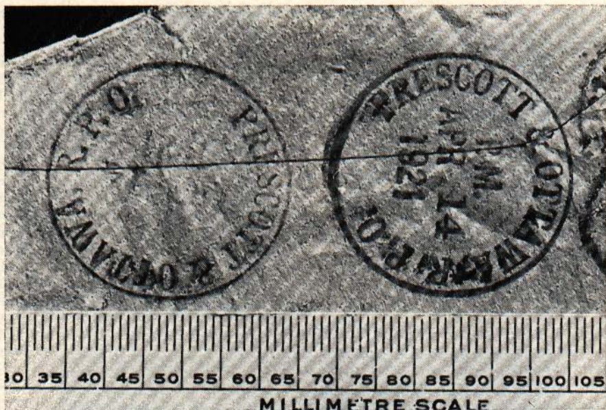
Fig. 4 — Unlisted Prescott & Ottawa R.P.O. P.M. April 14, 1921 (black)