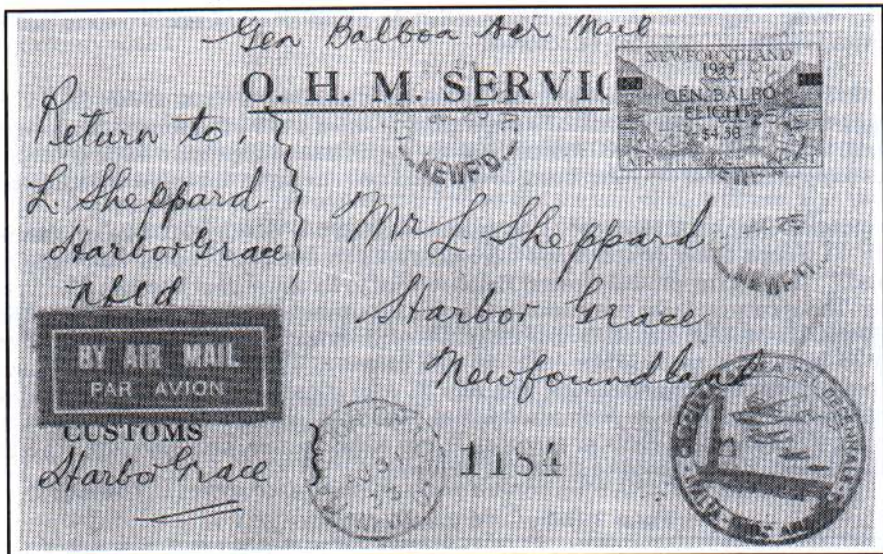
Figure 1: Balbo Cover Cancelled July 25, 1933. Front