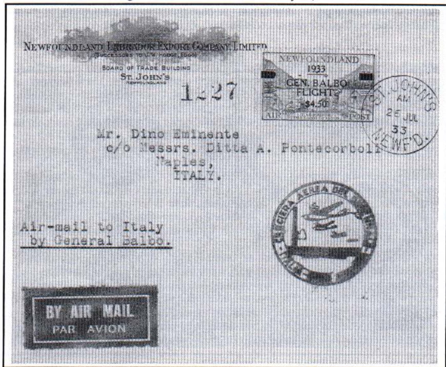
Figure 2: Balbo Cover Cancelled July 26, 1933

In Lowe [3] the information as to flight arrival is identical to Boggs. However the quantity printed is given as 8040 stamps of which 40 were defective and destroyed. Lowe